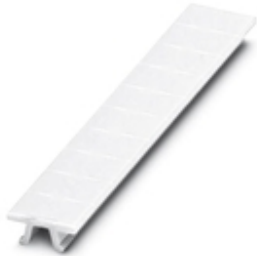
Zack marker strip, 10-section, vertically labeled with the consecutive numbers: 21 ... 30, white, width: 6 mm

Please be informed that the data shown in this PDF Document is generated from our Online Catalog. Please find the complete data in the user's documentation. Our General Terms of Use for Downloads are valid ( http://phoenixcontact.com/download )